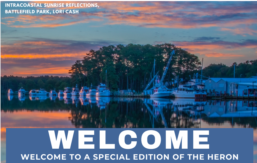
INTRACOASTAL SUNRISE REFLECTIONS, BATTLEFIELD PARK, LORI CASH